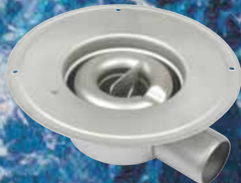
LOWER PART FOR LIQUID MEMBRANES

In addition, gratings designed by artists or with logos can be supplied for larger projects.