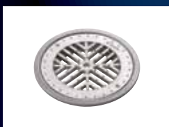
Circular for concrete

BLÜCHER® Drain Multi mounting sets are available in various shapes and for a range of applications