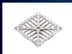
HygienicPro grating for heavier weight loads 150 mm, 200 mm and circular