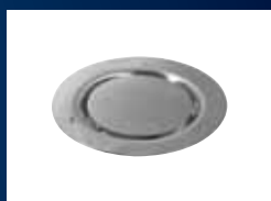
Circular for vinyl