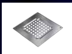
Square 200 mm