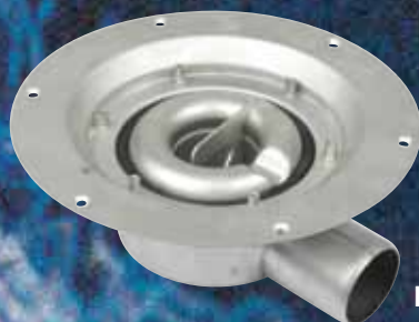
LOWER PART FOR ALL TYPES OF FLOORING