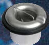
COMPACT WATER TRAP 50 MM WATER SEAL HEIGHT